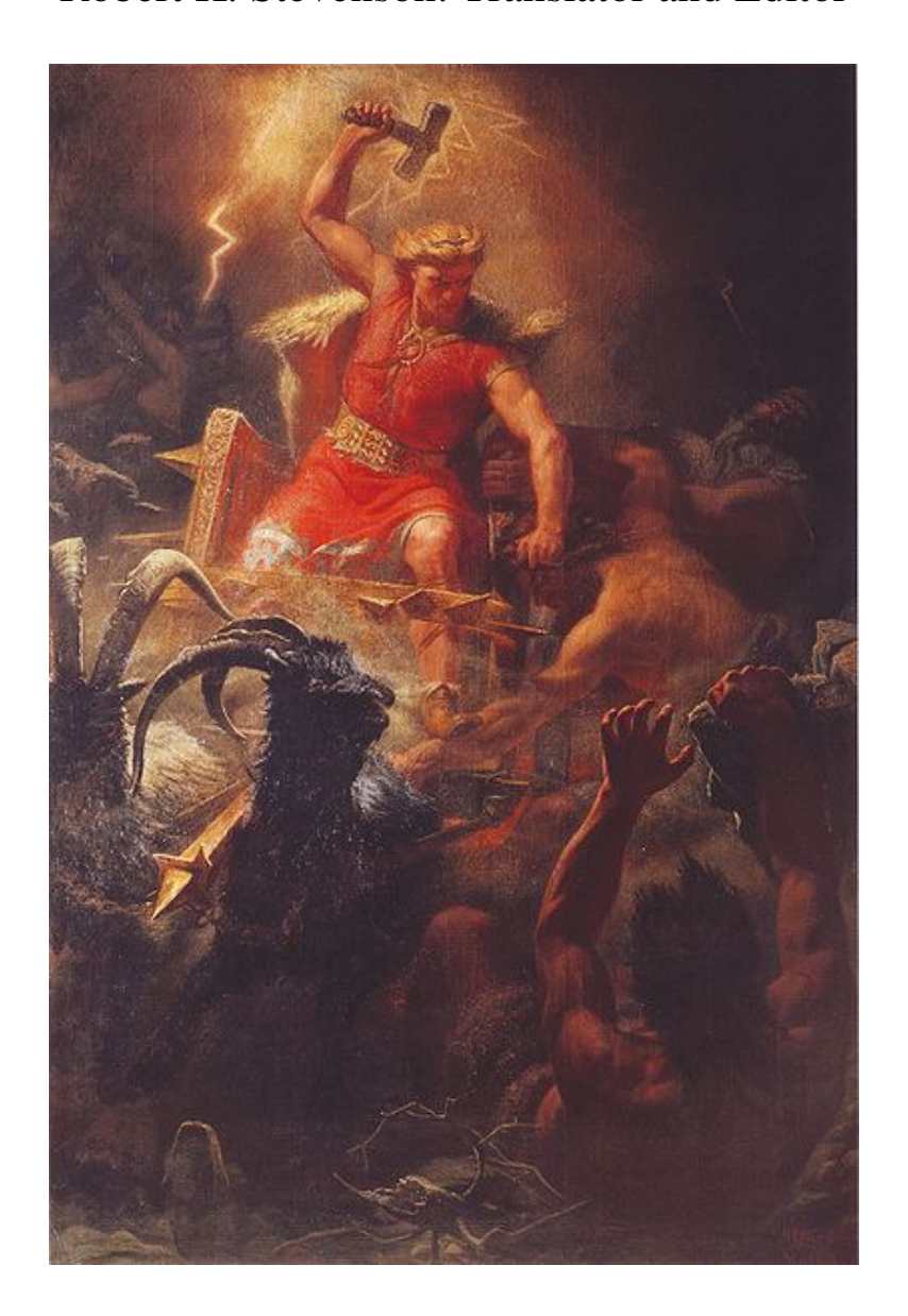
Thor, Norse god of thunder and lightning