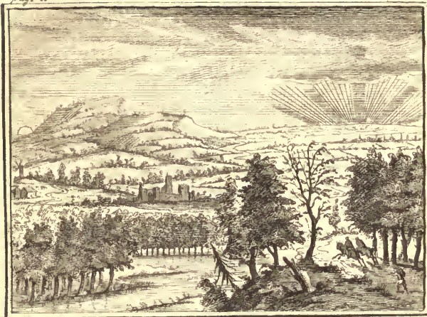
By Cole Sculp